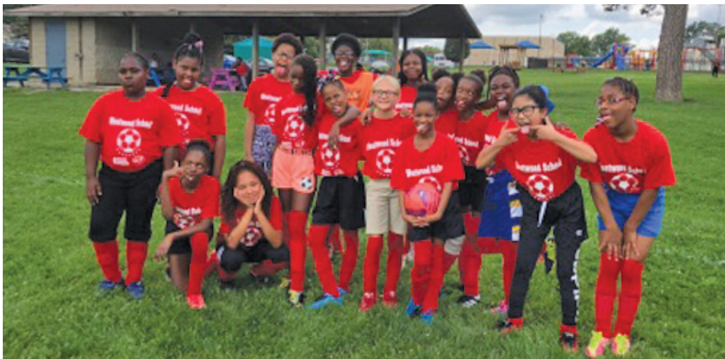
Westwood Elementary School soccer players pose in their new jerseys before a scrimmage!

Real competition is also one of the new pieces of the 2018 school year. For the first time in recent history, CPS Athletics has provided support by organizing a scrimmage schedule, supplying sport equipment/transportation and hiring certified referees for each scrimmage. This program allows our CPS elementary schools to travel to other CPS schools within a geographical boundary set by CPS Athletics. The parent support, mixed with phenomenal work from our Resource Coordinators and Activities Beyond the Classroom, has helped pave the way in making these scrimmages successful and we look to continue implementing travel and scrimmages at as many schools as possible moving forward!