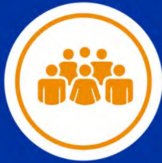
Student-Centered Decision Making