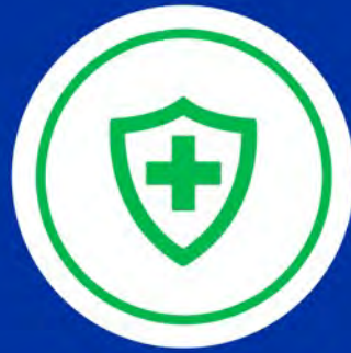
Health and Safety