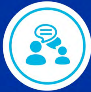
Community Engagement and Influence